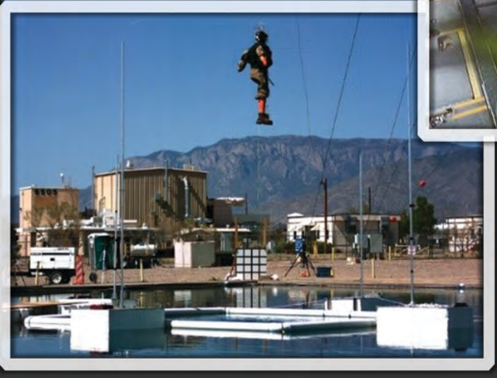
In the Air