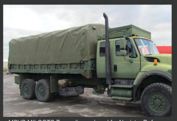
MSVS MILCOTS Tarpaulin produced for Navistar Defence

Through decades of experience building components for vehicle prime contractors, we've gained the expertise to develop products for manufacturability and performance.