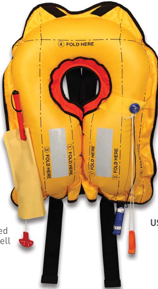
Inflated Vest Cell