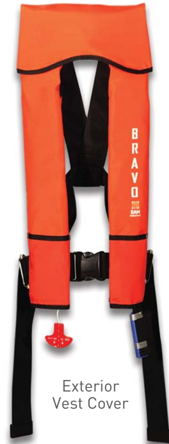
Exterior Vest Cover