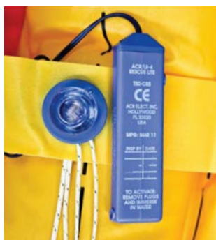
VEST LOCATOR LIGHT & WATER-ACTIVATED BATTERY