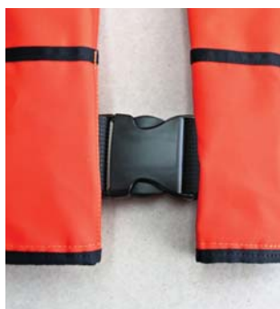
ADJUSTABLE 2" WAIST STRAP