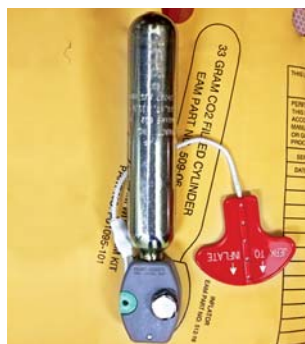
CO 2 INFLATION CYLINDER