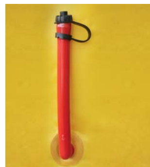
ORAL INFLATION TUBE WITH DUST COVER