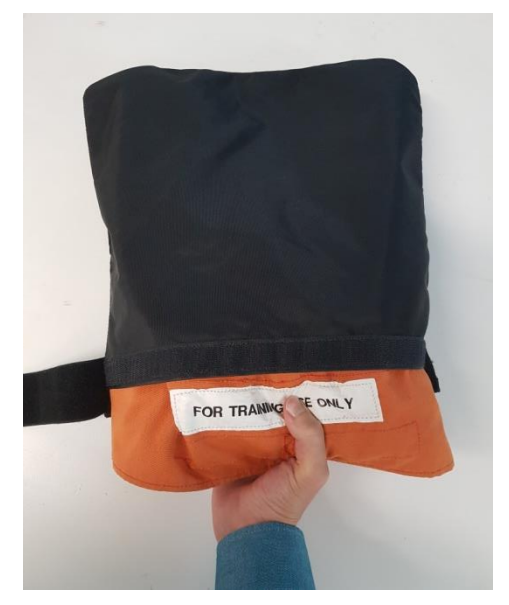
Figure 8: Placing fully folded PBE into re-useable pouch

4. Place the unit in the re-useable pouch and seal the Velcro strip (Figure 8).