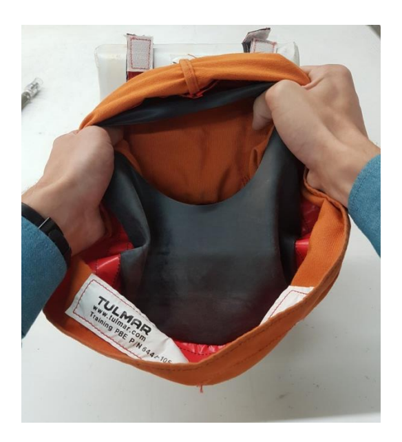
Figure 4: Neck seal stretched open

3. Hold the smoke hood in front of you, stretching the neck seal open with both hands (Figure 4).