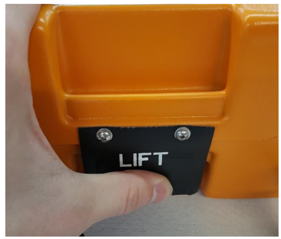
Figure 9: Closing clasp of box assembly

5. Insert the hood and pouch into the box assembly and close the lid. Fasten the lid by closing the snap on the black flap marked 'LIFT' (Figure 9).