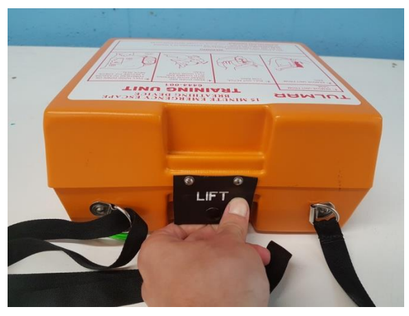
Figure 2: Opening box assembly

1. If the PBE is stored in the box assembly, open the box by pulling on the black tab marked 'LIFT' and remove the PBE from the box (Figure 2).