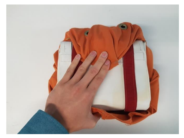
Figure 7: Folding top and bottom of PBE around simulated O_2 generator

3. Fold the top and bottom of the device inwards around the simulated O_2 generator to match the size of the pouch (Figure 7).