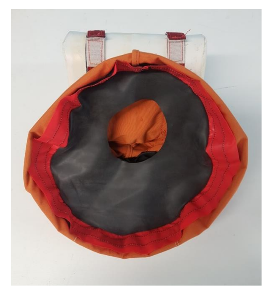
Figure 10: Neck seal orientated with opening closest to rear of hood and Velcro strip facing downwards.

2. Insert the neck seal into the opening and fasten with the Velcro strip along its perimeter. Be sure that the hole in the neck seal is closest to the rear of the hood. Also ensure that the neck seal is positioned with the rubber or latex seal facing upwards and the Velcro strip downwards when installed. Installing the neck seal in the wrong direction may cause it to detach during operation (Figure 10).