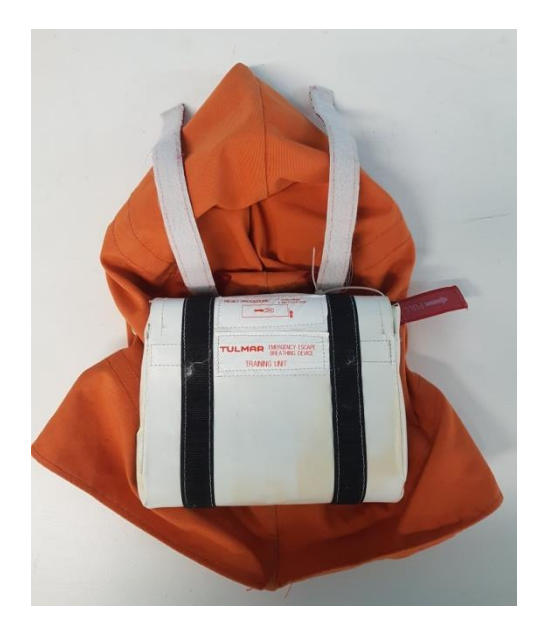
Figure 11: Installing simulated O2 generator with actuation pin at top right corner

3. Attach the simulated O<sub>2</sub> generator to the two Velcro straps at the rear of the hood with the actuation pin on the upper right-hand side (Figure 11).