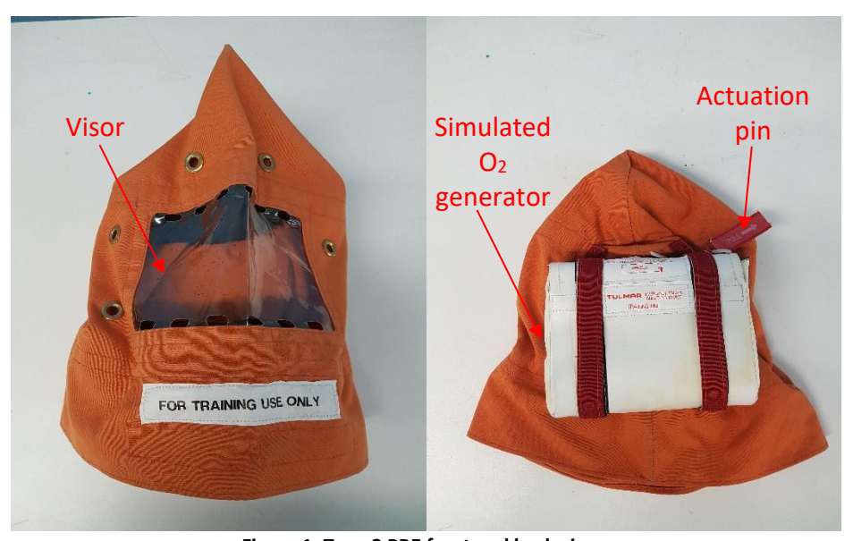
Figure 1: Type 2 PBE front and back views