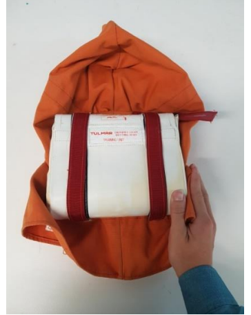
Figure 6: Folding sides of PBE inwards