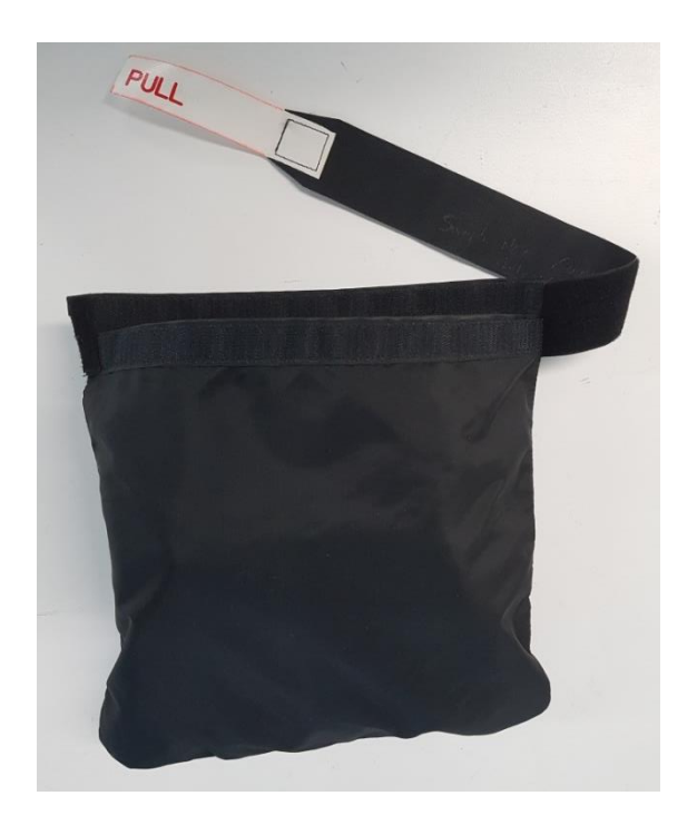
Figure 3: Re-useable pouch

2. If the PBE is in the re-useable pouch, open the pouch by pulling the white 'PULL' label on the Velcro strip along the top of the pouch, then remove the hood (Figure 3).