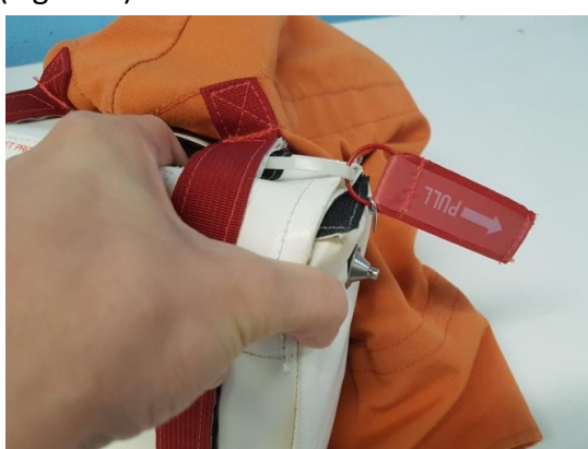
Figure 5: Activation mechanism plunger depressed to reveal hole for actuation pin reset.

The PBE should be stored in a protective container to prevent damage when not in use. If you have the re-useable pouch and/or the box assembly, the device can be stored within by following the instructions below. If your kit does not include the re-useable packaging, the PBE can be folded in half and stored in a 16" by 20" re-sealable plastic bag. The activation mechanism should be reset by pressing in on the plunger and reinserting the actuation pin to store the device in a ready to use configuration (Figure 5).