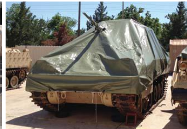
Combat & Tactical Vehicles