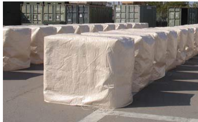
Power Generation / HVAC