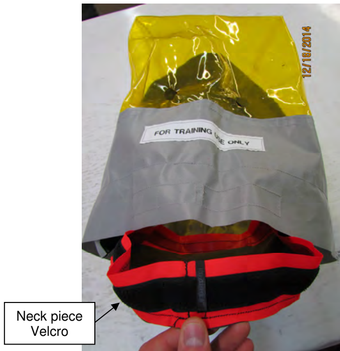
Figure 3: Neck piece Fastened to the hood

Pictures below presents a closer view of how to install the neck piece. Figure 4 below shows a neck piece cut in half and fastened to the hood.