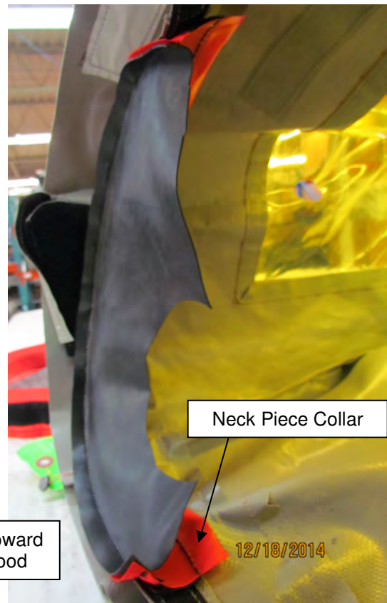
Figure 4: Neck piece cut in half