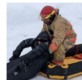
Ice Water Rescue