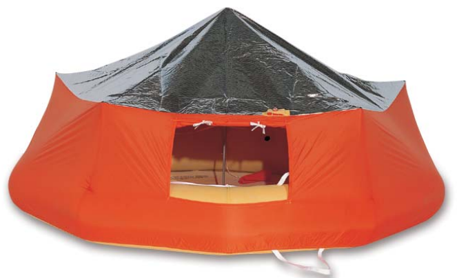
T9 LIFE RAFT Radar Reflective Canopy