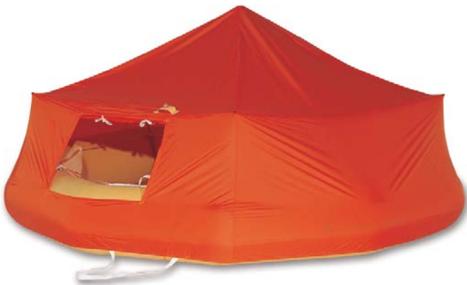
T9 LIFE RAFT Standard Canopy

ALL RAFTS CAN BE CUSTOMIZED WITH CANOPY OPTIONS