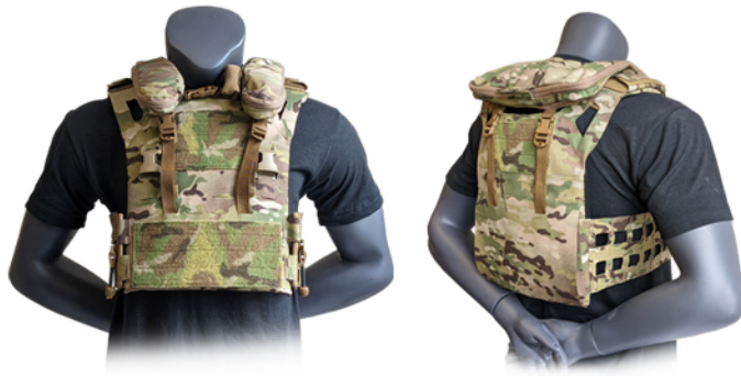
Ergonomic design allows full range of motion and weapons handling