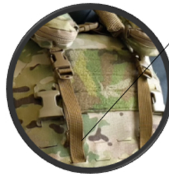
TUL-BAR attachment system maximizes available MOLLE / PALS real-estate while securing life preserver to armor carrier.